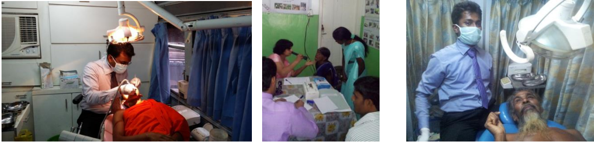
Screening programmes in Badulla district