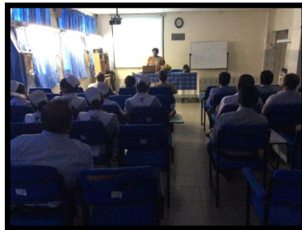
Dental Institute, Colombo