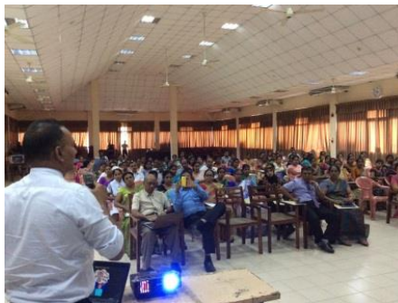
Programme for HLC staff at Rathnapura